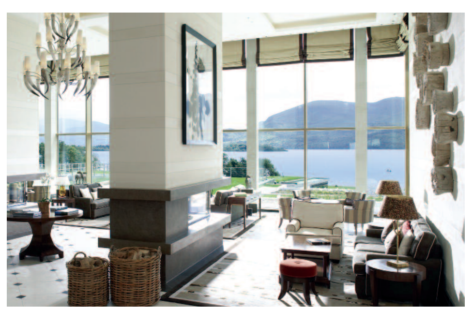
The Europe Hotel, Killarney, Co. Kerry

Further information on the programme will be available on the College website www.eyedoctors.ie Looking forward to seeing you in Killarney!