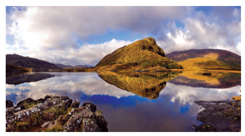
Lakes of Killarney, Co. Kerry.

The Irish College of Ophthalmologists Annual Conference will be held in The Europe Hotel Killarney from Wednesday 18th to Friday 20th May.